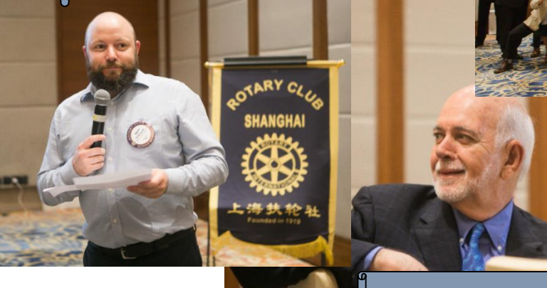
Moments of the night