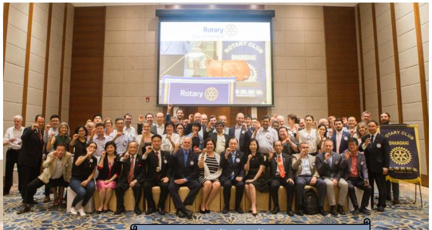
Polio Eradication Cases: Almost 0!